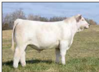
WC Paramount 4120 PET