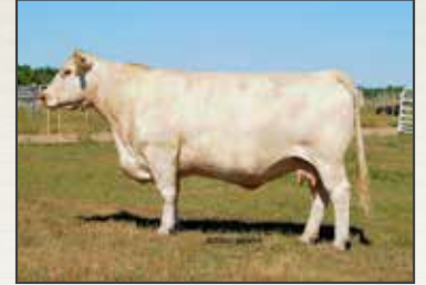
WCCC Miss Alliance 428