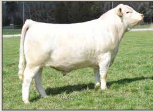
WC Doubletree 2009

The 3 Lot 9 eggs are sired by the breed's most popular A.I. sire, LT Ledger 0332 who sold for $105,000 in 2011 and out of the dam of WC Doubletree 2009 P. This could be the best mating ever to this great donor dam.