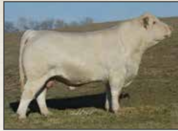
WC Capital Gain

These embryos are sired by Capital Gain our awesome J139 son and out of our great maternal power donor Miss Alliance 428. She is the dam of WC Nirvana 1153 a high-selling son in our 2012 bull sale to Clear Creek Charolais and a member of our Denver Grand Pen; she is the dam of WCCC Insight a herd sire for Wooden Cross; she is the dam of WC Penelope the $7,800 2011 Wright Female Sale topper selling to Rathmoure Charolais in Michigan; she is the dam of WC Ruger herd sire for Triple T Charolais in Iowa and she is the dam of WC Guns & Roses, the $18,000 herd sire for Wildcat Creek Charolais.