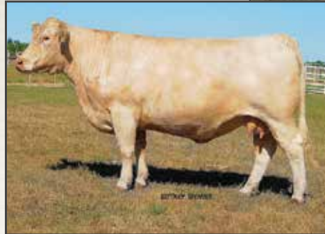
WC CCC Impressed 6510 - Dam of Lots 27-31