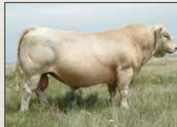
LT Blue Value 7803