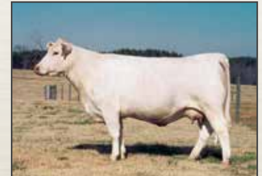
JWK Clarice J139