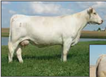
SCC lady Mac K118

Three of these embryos are sired by the AICA Sire Summary #2 ranked Multiple Trait Leader, the #16 Weaning Weight Trait Leader and the #2 Yearling Weight Trait Leader, M6 New Standard. The dam of these embryos SCC Lady Mac K118 is one of the strongest cow lines that came out of the Southern Cattle Company breeding program. At 12 years of age she was still one of the highest sellers in the EJ Shepherd Dispersal in Iowa at $11,250. New Standard sired the top selling open heifer at our December Female Sale at $23,000.