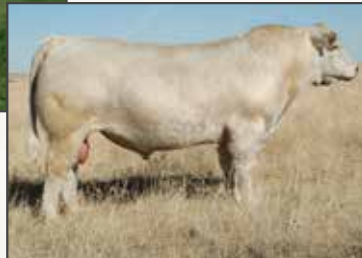
LT Long Distance

Three of these embryos are sired by the AICA Sire Summary #2 ranked Multiple Trait Leader, the #16 Weaning Weight Trait Leader and the #2 Yearling Weight Trait Leader, M6 New Standard. The dam of these embryos SCC Lady Mac K118 is one of the strongest cow lines that came out of the Southern Cattle Company breeding program. At 12 years of age she was still one of the highest sellers in the EJ Shepherd Dispersal in Iowa at $11,250. New Standard sired the top selling open heifer at our December Female Sale at $23,000.