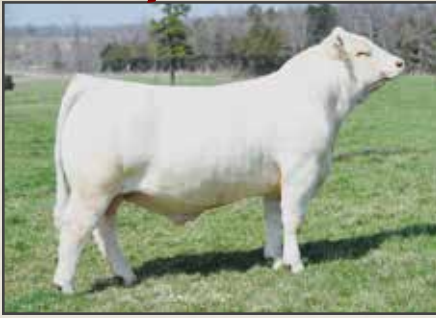
WC Benelli 2134

These are the only embryos that we will offer out of our 2013 Wright Charolais Bull Sale top seller WC Benelli 2134. He topped that sale when one-half interest sold for $50,000, of course Benelli was sired by DA Passport and out of JWK Clarice J139. The dam Mavis 4528 is the dam of the $7,500 heifer calf that we sold in the 2011 National Sale in Louisville.