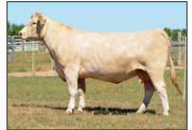
WC CCC Ms Wind 440

These embryos will have EPD's through the roof. The donor of these embryos has produced five herd sires with an average weaning weight of 741.1 lbs! A Bud Heavy daughter at nine months of age out of a daughter of #440 sold for $10,500 in our 2013 female sale.