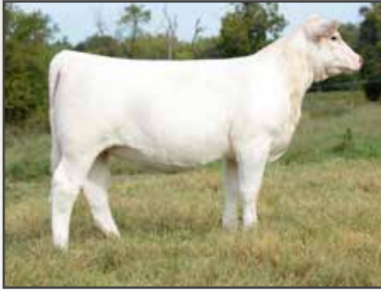
LT Blue Mountain x Sweetheart 7M cow family