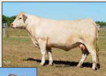
LT Mary Maid 5363

The great dam of these embryos is LT Mary Maid 5363 who produced the powerful WC Going The Distance 2538 in which a one-half interest sold in our 2014 Bull Sale for $15,000 to Cavender Ranch in Texas. He was the lead bull of our fall born long yearling Denver Pen. Watch for more from this cow family in the future.