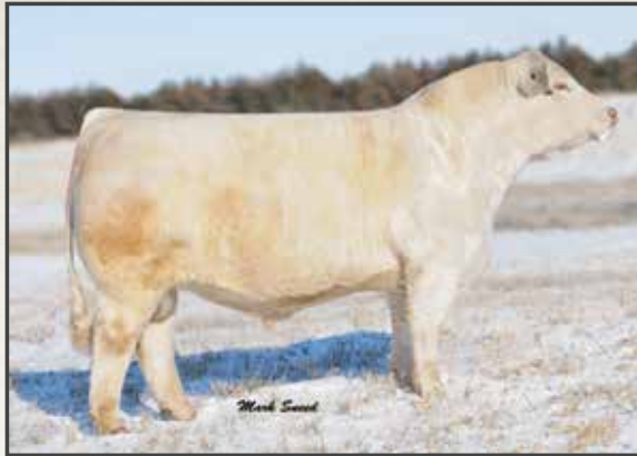
TR PZC Rapid Fire 3775

Bud Heavy topped the 2012 Wright Charolais Bull Sale when one-half interest sold for $32,500. He was the 2011 National Reserve Grand Champion Bull. The dam of these embryos was the National Cow/ Calf Pair at the 2010 National Charolais Show. She is a daughter of the National Champion PF Impressed 620 P ET. A daughter of #6510 produced the high-selling fall long-yearling bull in the 2013 Bull Sale at $8,500. The donor dam of these embryos is now a donor for Rathmourne Charolais in Michigan.