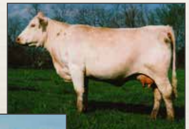
WDZ TR Solera 6054

These Ledger embryos are out of the Thomas Ms Impressive 0641 cow family that has dominated the Charolais show circuit for years with multiple National Championships.