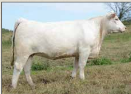
WC Clarice 2533 P ET