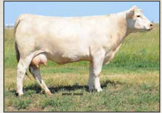
WC Praise 0058