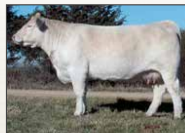
OW Miss Marion 0025

These embryos are full sibs to DA Passport 502 P ET and WC I'll Have Another!