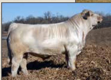
WC Going The Distance 2538

The great dam of these embryos is LT Mary Maid 5363 who produced the powerful WC Going The Distance 2538 in which a one-half interest sold in our 2014 Bull Sale for $15,000 to Cavender Ranch in Texas. He was the lead bull of our fall born long yearling Denver Pen. Watch for more from this cow family in the future.