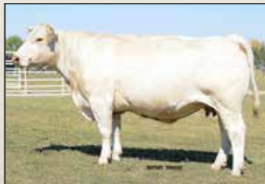
TTR Clarice S1685

The Lot 15 embryos are out of LT Ledger 0332. The Lot 16 embryos are out of LT Blue Value 7903 and #1685 will be calving ease and phenotypic masterpieces.