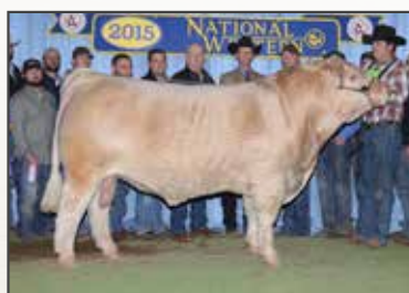
WC I'll Have Another 2190 ET

The Wright Ranch wants to see someone develop another genetic masterpiece with this semen of DA Passports. During the 2013 Wright Charolais Bull Sale a full brother to DA Passport named WC I'll Have Another 2190 ET sold for $18,000 to Bar J in Texas and JVS in Louisiana and then went on to be selected the 2014 National Show Junior Champion Bull and then on to Fort Worth, Houston and the Missouri State Fair to be the Grand Champion Bull. He then claimed the Houston Grand Championship again in 2015 and will be the AICA Show Bull of the Year!