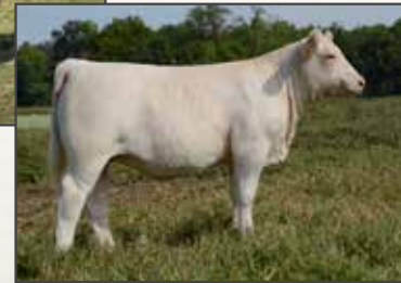
CCC Bud's Elvira 311