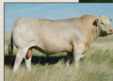
LT Ledger 0332