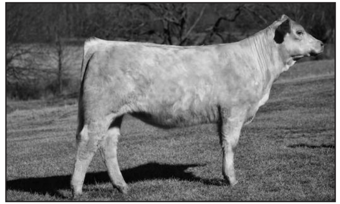
Lot 17 - Baney MS Firewater 3004 Pld