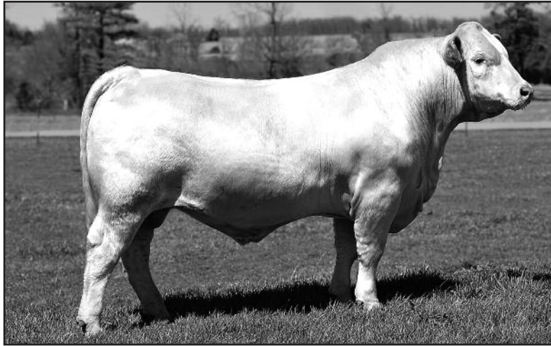
Lot 3 - Ace-Orr Efficient 972