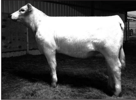
Lot 18 - SKS Lucy A93