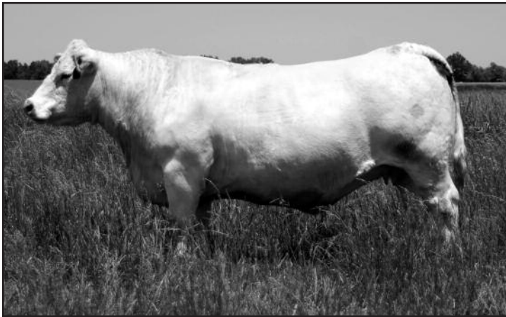
Creek Cut Greta 576P ET