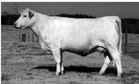
JWK Clarice J139 ET