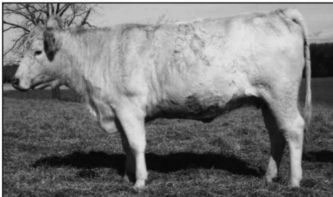
Lot 27 - DC MS Pomona Flash C002P