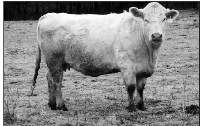
Lot 32 - RCR Miss Morgan 7757 P