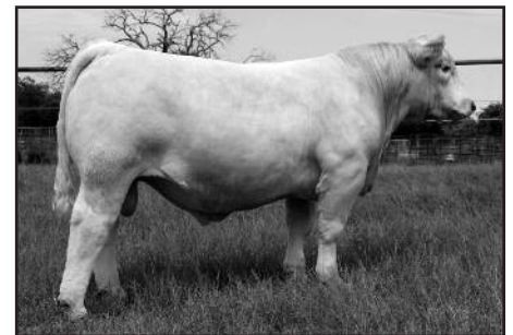
M6 Bells & Whistles 255P