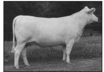
MV 934 Venessa 280 ET Full sister to D029