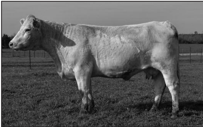
Lot 23 - Link MS 847 Sky 536 P