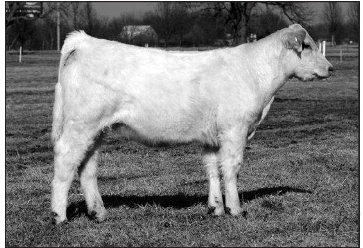
Lot 15 - WIA MS Sanchez Pld

LHD MR Perfect Y416 LHD MS Classic Bell X613 RC Bud 04 ET Miss Showgun RC 416