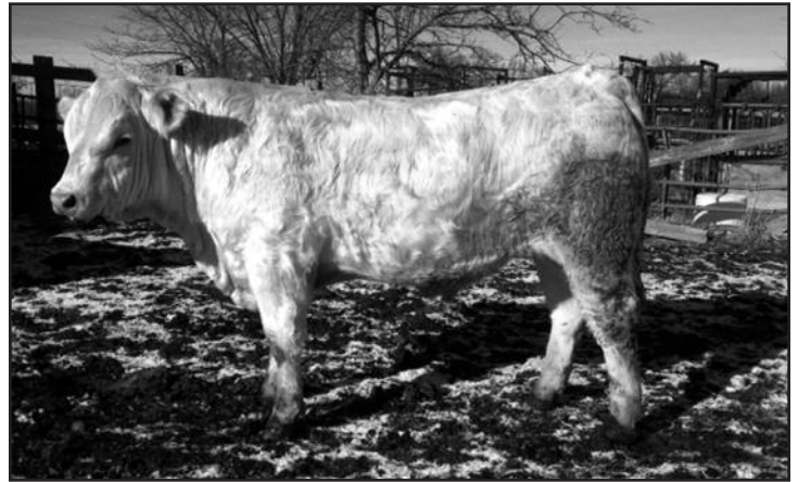
Lot 7 - RCR Long Distance 3993