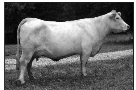
B/T MS Hoodoo 6017-460 ET

The guarantees on the Frozen Embryos are under the condition that the transplant work is done by an embryologist approved by the seller.