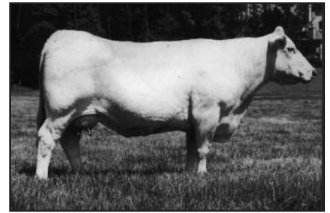
JWK Vanessa D029