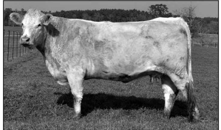
Lot 20 - Link MS L823 Sky 34R P