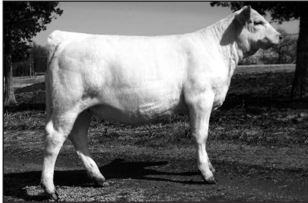
Lot 13 - G4 MS Kay