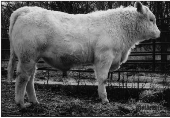
Lot 12 - DC Pomona Grid C305P