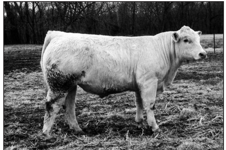
Lot 10 - Big Creek Master Chief 334 Pld