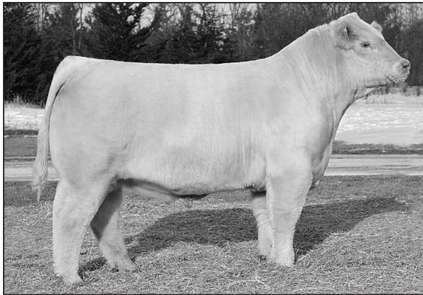
TR MR DIABLO 2742Z