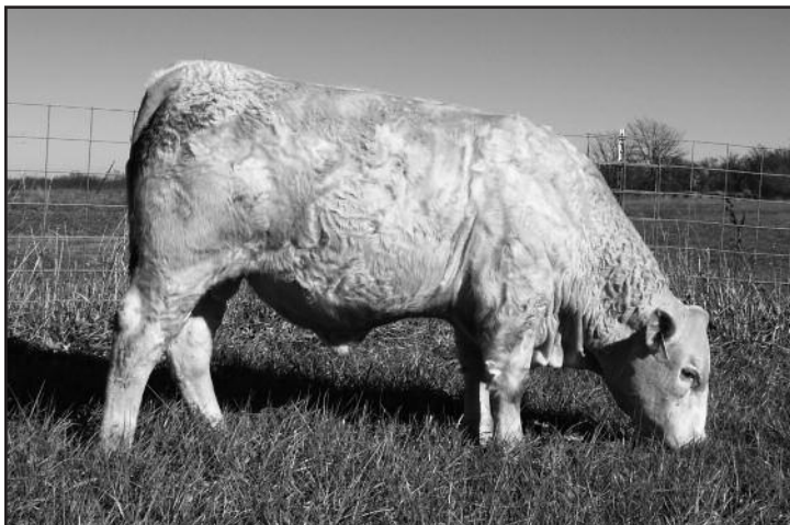
Lot 6 - CR/RCR Lunch Time 2979