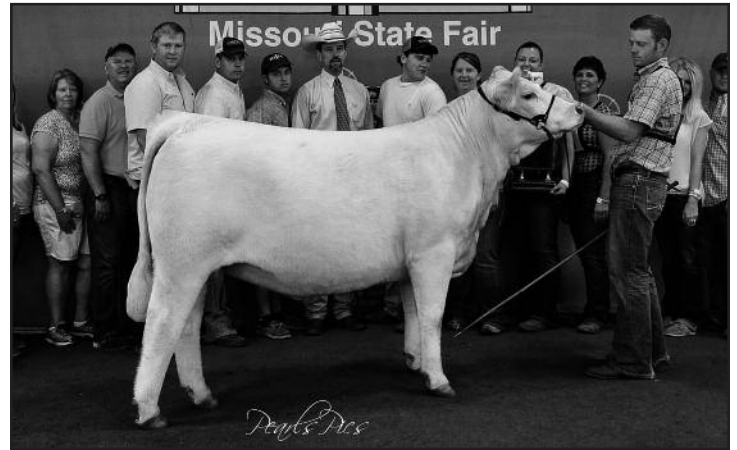
RF Greta 96Z