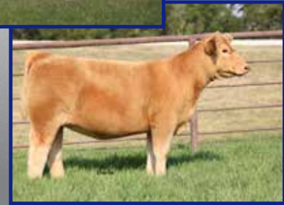
Monopoly x Ivory Angel