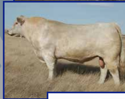
LT Ledger 0332