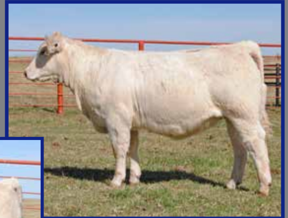
3031 - Cooley Royce