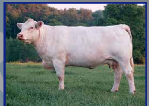
Dam of Lot 24

This special sale attraction offers unlimited genetic potential for progeny that are sure to win your attention. This flush is out of AML Vanessa 107 ET a great young donor that looks as good on paper as she does in the picture. Her maternal granddam is the now deceased breed legend, JWK Vanessa D029, one of our breed's very best. Her dam #4131 is one of Oak Hill Farms best products and is now a donor for Bamboo Road's E.T. program. A full sister to her #4120 sold for $16,500 in the 2007 National Sale in Louisville.