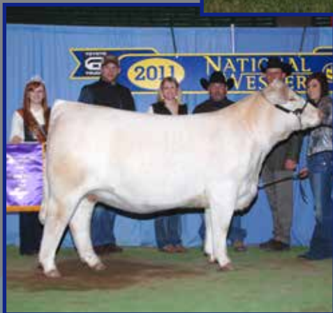
HF Mustang Sally