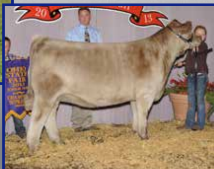
Supreme Heifer 2013 Ohio State Fair