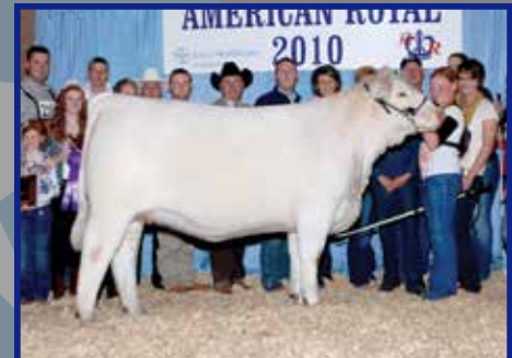
Dam of Lot 12

It's easy to see that this heifer will do some major damage in the senior yearling division this coming show season.