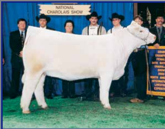
Dam of Lot 14