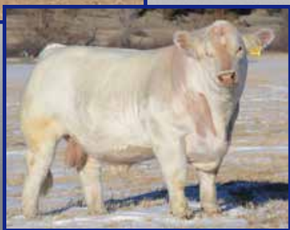
CML Encore 4Y

Presented by: Silver Spur Ranches, Encampment, Wyoming