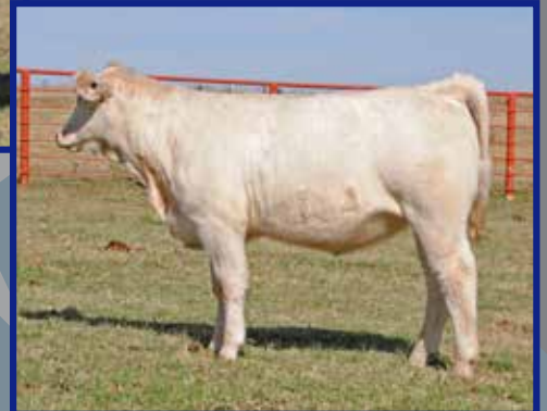
3032 - Encore