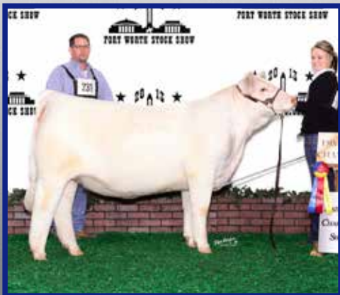
Lot 25 - Spring Calf Champion

If you're looking for power and balance, show ring appeal and crowd popularity, your search is over. Her progeny by any blend of purebred or calf-calf herd sires will not disappoint.