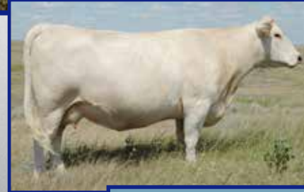
LT Brenda 6120 Pld