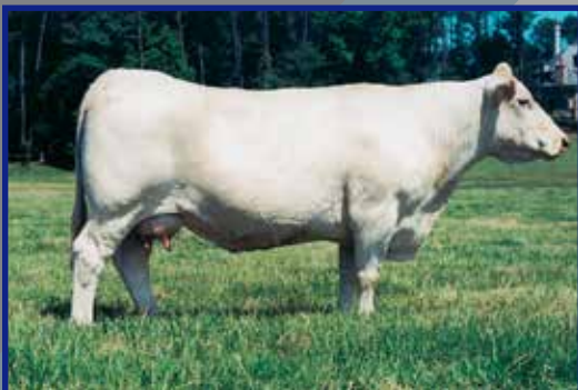
JWK Vanessa D029