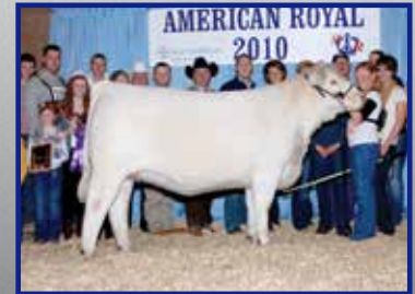
Dam of Lot 7