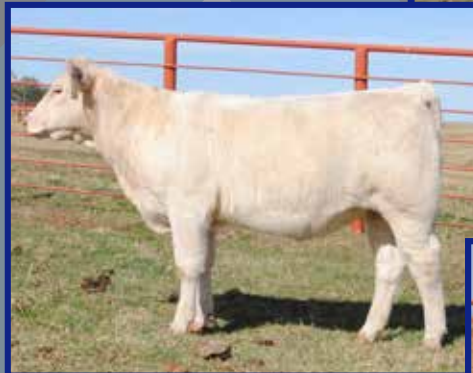
3024 - Fire Water