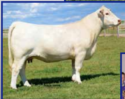
HF Mustang Sally 904

Presented by: Thomas Ranch, Harrold, South Dakota and Hansen Charolais, Turton, South Dakota