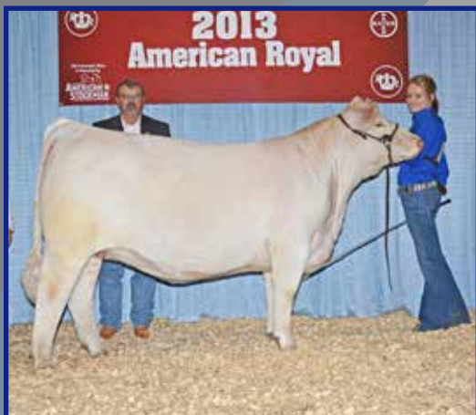
Wal-Mar Caught on Fire 210 P