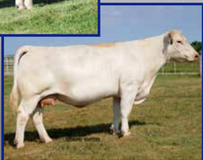
Dam of Lot 9