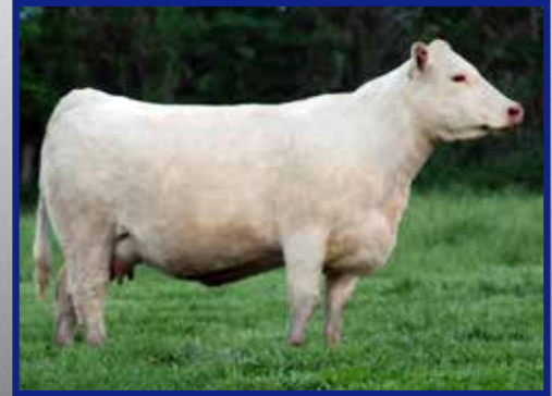
$10,000 full sister to Lot 19