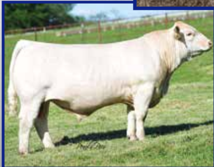
Sire of Lot 9