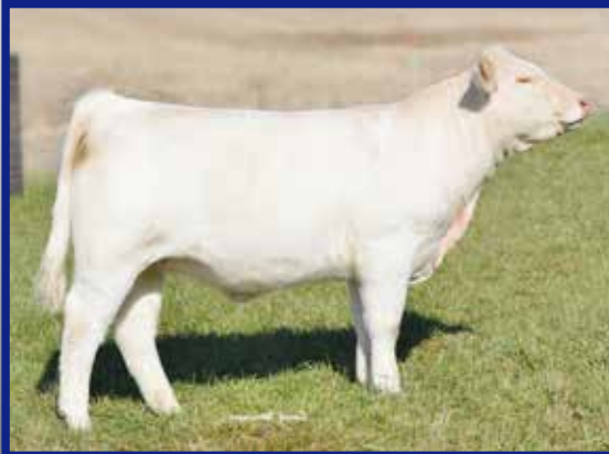
Lot 17 daughter

Prepare yourself for success with this genetic giant in your E.T. program!