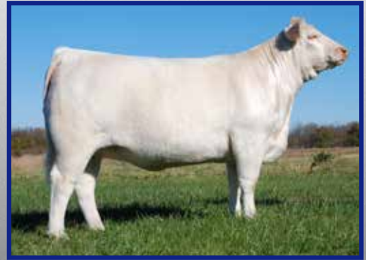
Dam of Lot 15

Bred AI on November 7, 2013 to LT Ledger 0332 Pld.