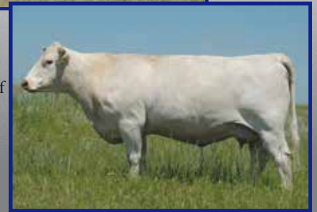
LT Brenda's Ease 3055