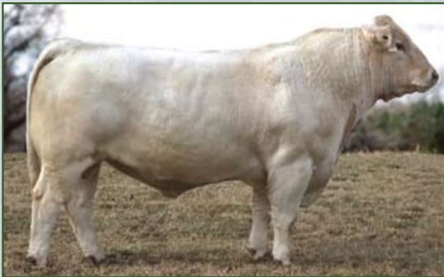
THREE TREES WIND 0383