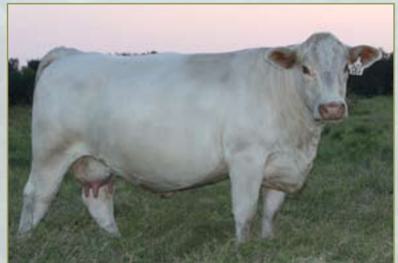
MS COOLEY S DUKE 1107N60 – DAM OF COOLEY ROYCE 1107T39

BW: 86 lbs ADJ.WW: 749 lbs R: 116 ADJ.YW: 1395 lbs R: 120 EPDs: -1.8 3.1 36 80 17 0.2 35 0.8 Carc. EPDs: 34 0.52 -0.013 0.09