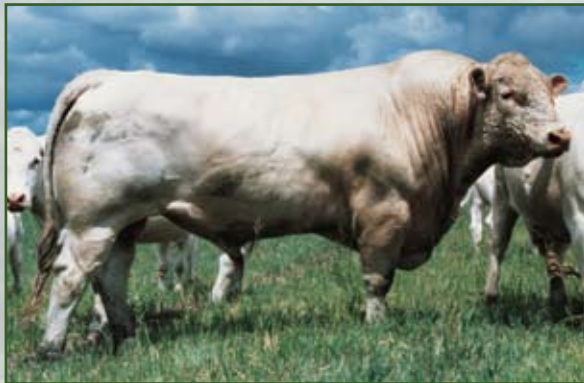
WCR SIR FA MAC 2244